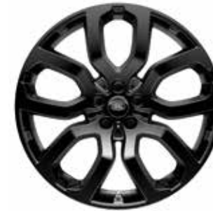
22" 5 SPLIT-SPOKE 'STYLE 5004' WITH GLOSS BLACK