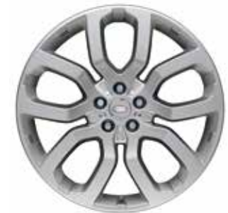
22" 5 SPLIT-SPOKE 'STYLE 5004' WITH SILVER FINISH