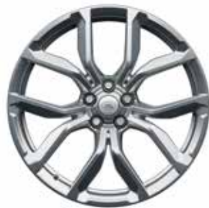
22" 5 SPLIT-SPOKE 'STYLE 5083' WITH SATIN POLISH FINISH