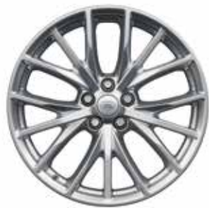
21" 5 SPLIT-SPOKE 'STYLE 5091' WITH SATIN POLISH FINISH