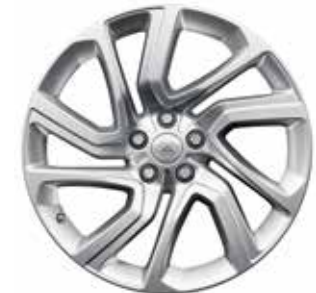
21" 5 SPLIT-SPOKE 'STYLE 5085' WITH SILVER FINISH