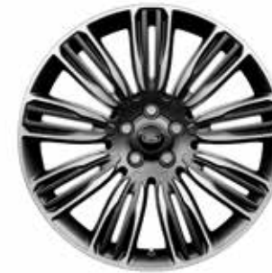
22" 9 SPLIT-SPOKE 'STYLE 9012' WITH DARK GREY DIAMOND TURNED FINISH