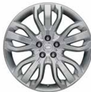
21" 5 SPLIT-SPOKE 'STYLE 5007' WITH SILVER FINISH