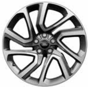
21" 5 SPLIT-SPOKE 'STYLE 5085' WITH DIAMOND TURNED FINISH