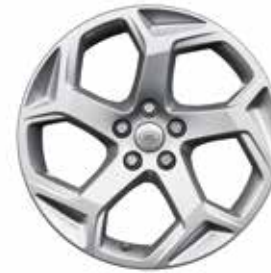
20" 5 SPLIT-SPOKE 'STYLE 5084' WITH SILVER FINISH

Sizes range from 19" to the highly desirable 22". With distinctive design cues, each one adds its own character to the overall look of the vehicle.