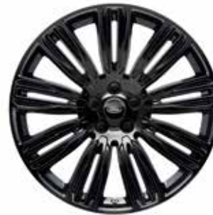
22" 9 SPLIT-SPOKE 'STYLE 9012' WITH GLOSS BLACK FINISH