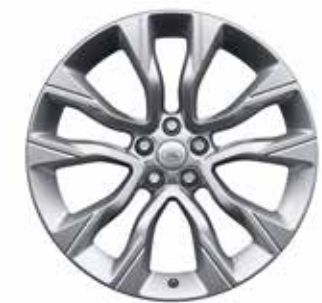
22" 5 SPLIT-SPOKE 'STYLE 5086' WITH SILVER FINISH