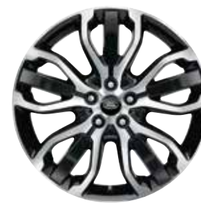
21" 5 SPLIT-SPOKE 'STYLE 5007' WITH GLOSS BLACK DIAMOND TURNED FINISH