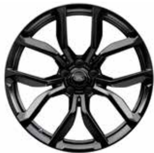
22" 5 SPLIT-SPOKE 'STYLE 5083' WITH GLOSS BLACK FINISH