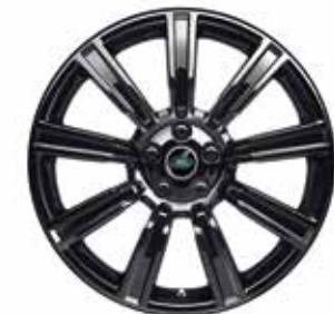
21" 9 SPOKE 'STYLE 9001' WITH GLOSS BLACK FINISH