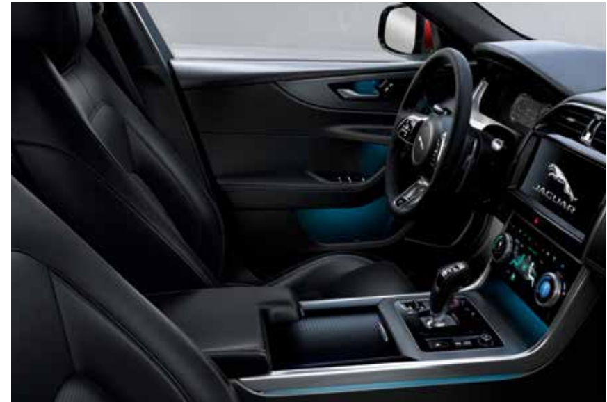
INTERIOR SHOWN: Ebony interior with Light Oyster Stitch, Perforated Grained Leather Sport Seats with Ebony Headlining. 301ML Available on R-Dynamic SE