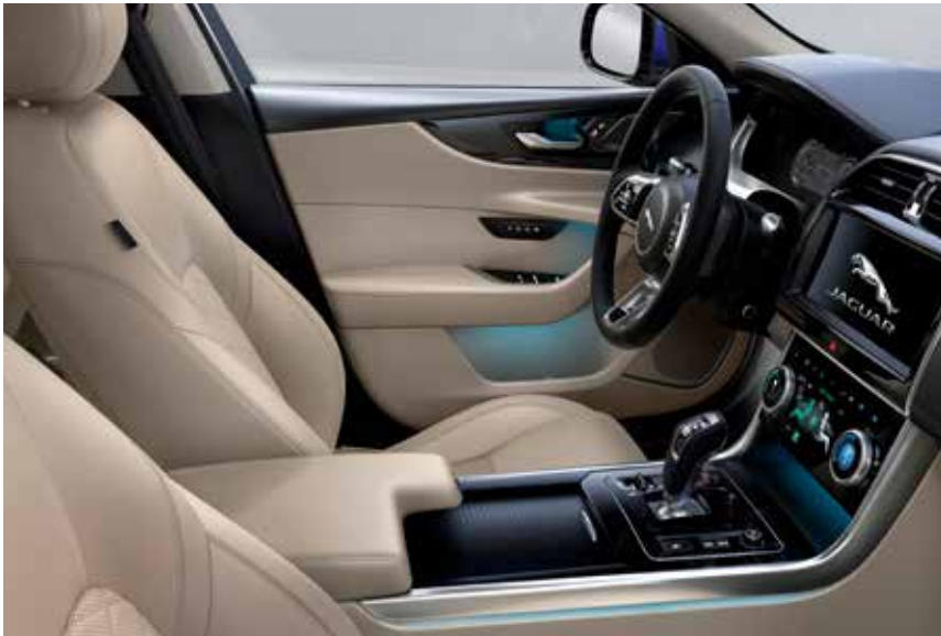
INTERIOR SHOWN: Ecru interior with Ecru Stitch, Windsor Leather Seats with Light Oyster Headlining. 301MH Available on SE