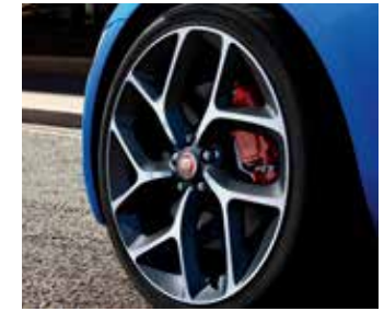
20" 10 SPOKE 'STYLE 1014'