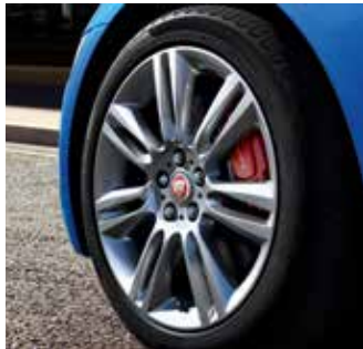
18" 7 SPLIT SPOKE 'STYLE 7009'