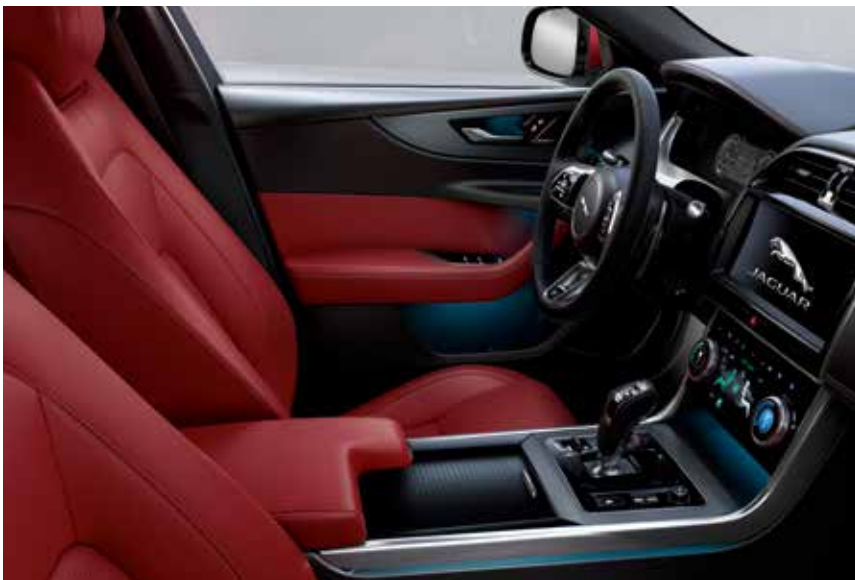
INTERIOR SHOWN: Mars Red with Mars Red Stitch, Perforated Grained Leather Sport Seats with Ebony Headlining. 301MN Available on R-Dynamic SE