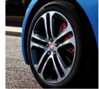
18" 5 SPLIT SPOKE 'STYLE 5029'