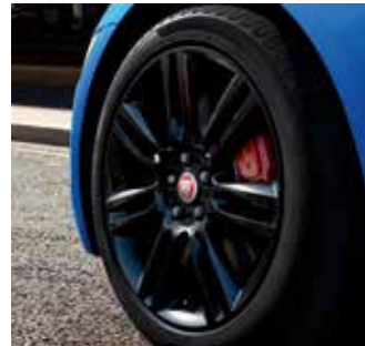
18" 7 SPLIT SPOKE 'STYLE 7009'