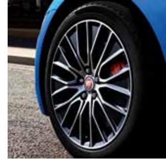
18" 10 SPLIT SPOKE 'STYLE 1049'