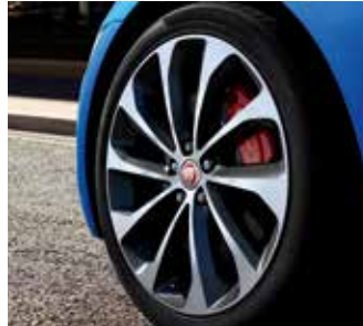
19" 10 SPOKE 'STYLE 1050'