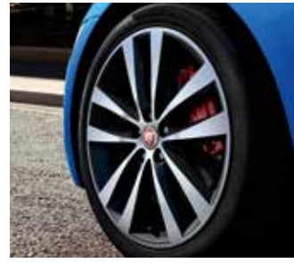
19" 5 SPLIT-SPOKE 'STYLE 5031'