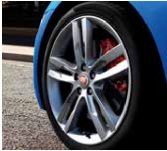
19" 5 SPLIT SPOKE 'STYLE 5071'