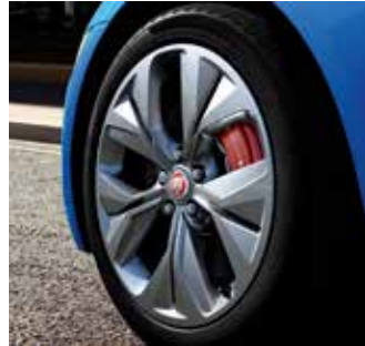
18" 15 SPOKE 'STYLE 1022'