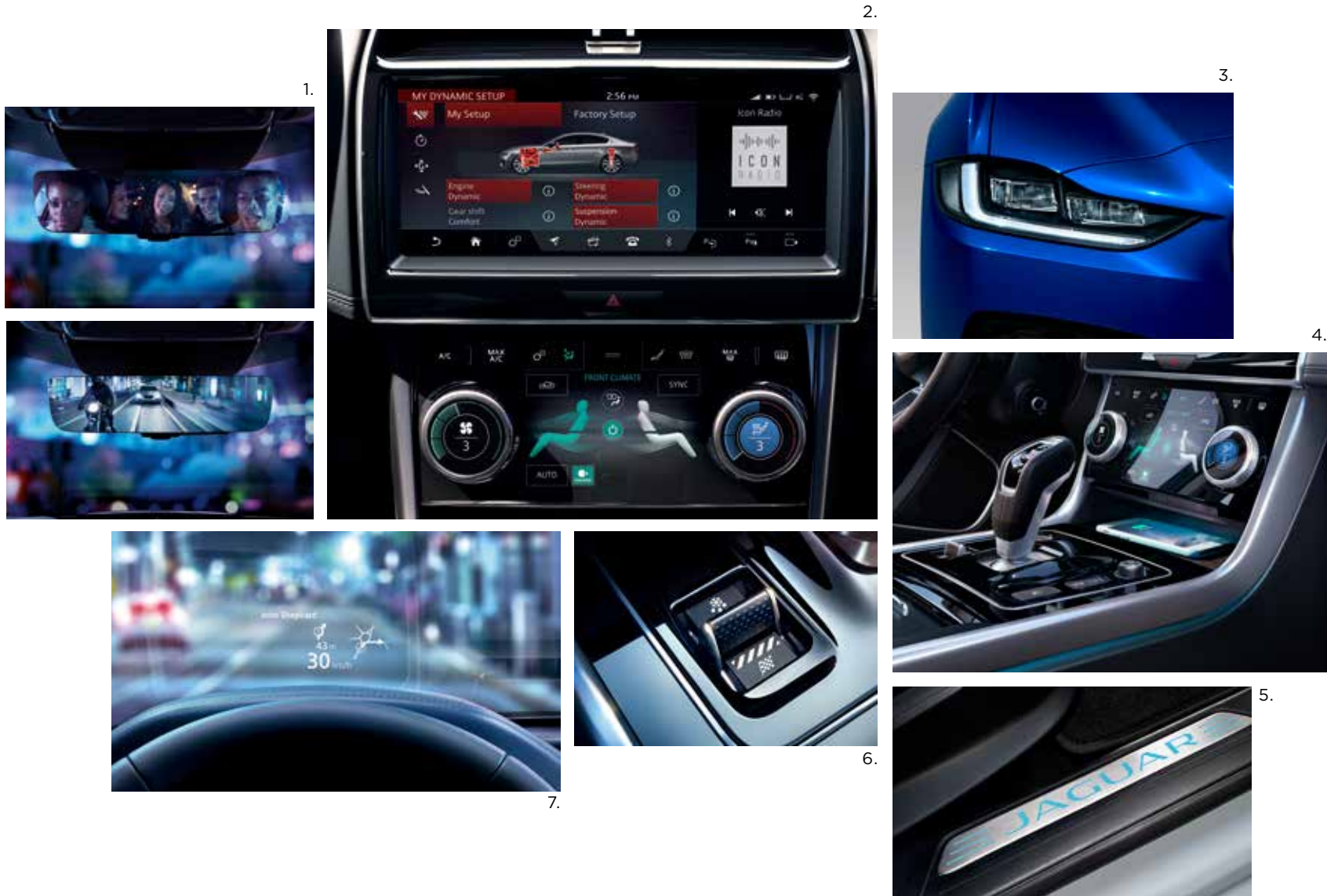
(1) ClearSight Interior Rear View Mirror. (2) Touch Pro Duo. (3) Matrix LED Headlights. (4) Wireless Device Charging. (5) Illuminated Treadplates. (6) Adaptive Dynamics. (7) Head-Up Display