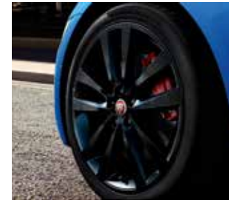
19" 5 SPLIT-SPOKE 'STYLE 5031'