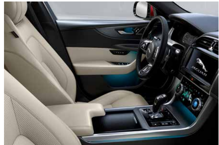
INTERIOR SHOWN: Light Oyster interior with Light Oyster Stitch, Perforated Windsor Leather Sport Seats with Ebony Headlining. 300MR Available on R-Dynamic SE & HSE