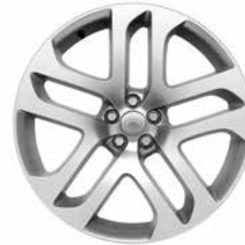
21" 5 SPLIT SPOKE 'STYLE 5078' SILVER