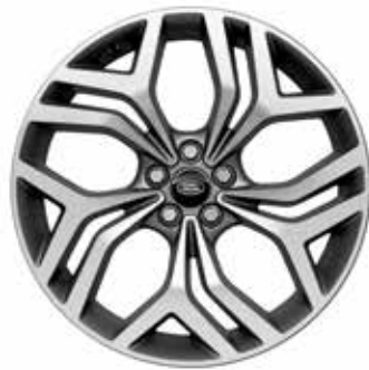
20" 5 SPLIT SPOKE 'STYLE 5079' DARK GREY & CONTRAST DT