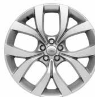
20" 5 SPLIT SPOKE 'STYLE 5076' SILVER