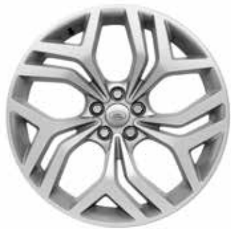
20" 5 SPLIT SPOKE 'STYLE 5079' SILVER