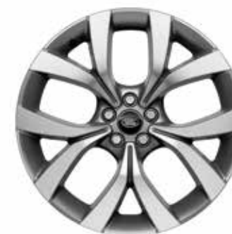
20" 5 SPLIT SPOKE 'STYLE 5076' SILVER & DIAMOND TURNED