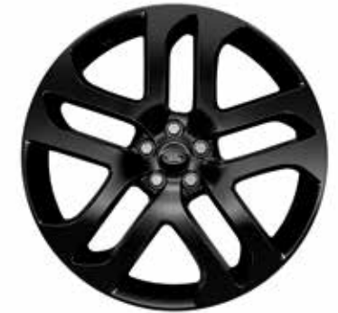
21" 5 SPLIT SPOKE 'STYLE 5078' GLOSS BLACK