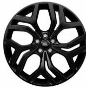
20" 5 SPLIT SPOKE 'STYLE 5079' GLOSS BLACK