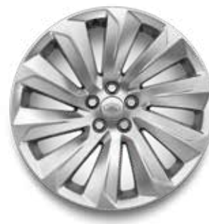
19" 10 SPOKE 'STYLE 1039' SILVER