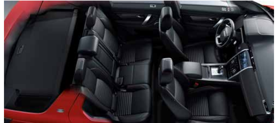
Interior shown: Discovery Sport R-Dynamic S interior with Ebony grained leather seats with Mars Red stitch and Titanium Mesh trim finisher.

Available exclusively as part of Discovery Sport R-Dynamic is a choice of two striking colourways. The look is augmented by the unique stitch featured on the seats and headrest.