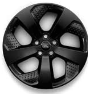
18" 5 SPOKE 'STYLE 5088' GLOSS BLACK