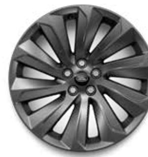
19" 10 SPOKE 'STYLE 1039' SATIN DARK GREY