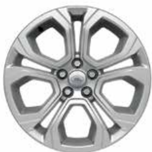
18" 5 SPLIT SPOKE 'STYLE 5075' SILVER