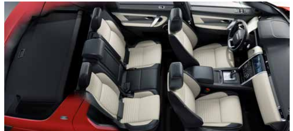
Interior shown: Discovery Sport R-Dynamic S interior with Light Oyster/Ebony Windsor leather seats with Light Oyster stitch and Titanium Mesh trim finisher.