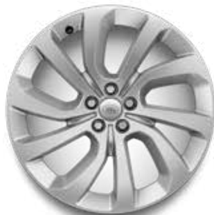
20" 5 SPLIT SPOKE 'STYLE 5089' SILVER