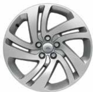
18" 5 SPLIT SPOKE 'STYLE 5074' SILVER

There are 10 wheel styles to choose from. Sizes range from 18" to the highly desirable 21". With distinctive design cues, each one adds it's own character to the overall look of the vehicle.