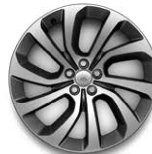
20" 5 SPLIT SPOKE 'STYLE 5089' GLOSS BLACK WITH CONTRAST DIAMOND TURNED