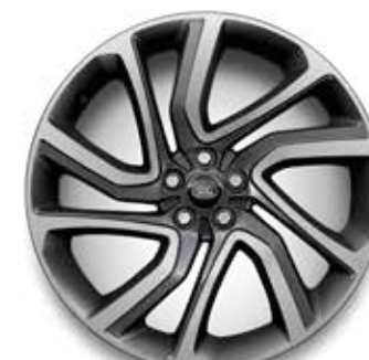
21" 5 SPLIT SPOKE 'STYLE 5090' GLOSS BLACK WITH CONTRAST DIAMOND TURNED