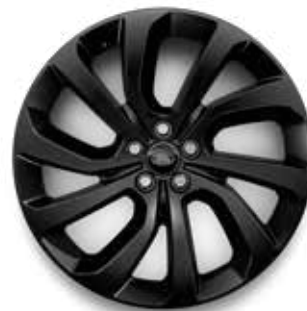
20" 5 SPLIT SPOKE 'STYLE 5089' GLOSS BLACK