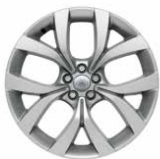
20" 5 SPLIT SPOKE 'STYLE 5076' SILVER