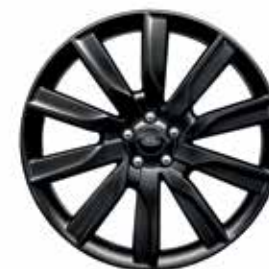
21" 10 SPOKE 'STYLE 1033' WITH GLOSS BLACK FINISH