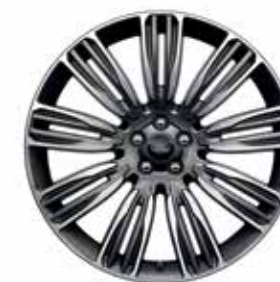
22" 9 SPLIT-SPOKE 'STYLE 9007' WITH DIAMOND TURNED FINISH