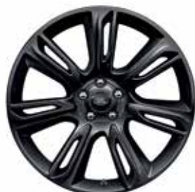
20" 7 SPLIT-SPOKE 'STYLE 7014' WITH GLOSS BLACK FINISH