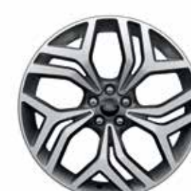
21" 5 SPLIT-SPOKE 'STYLE 5047' WITH DIAMOND TURNED FINISH