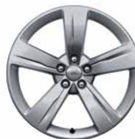
19" 5 SPOKE 'STYLE 5046'

Sizes range from 19" to the highly desirable 22". With distinctive design cues, each one adds it's own character to the overall look of the vehicle.