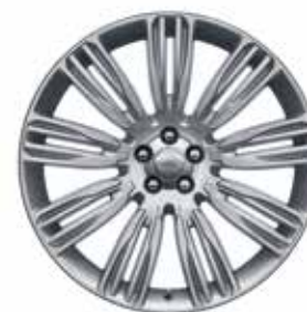
22" 9 SPLIT-SPOKE 'STYLE 9007'