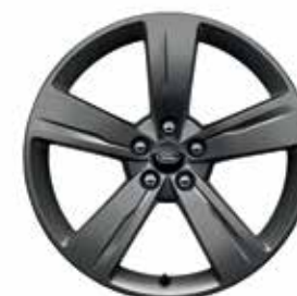
19" 5 SPOKE 'STYLE 5046' WITH SATIN DARK GREY FINISH