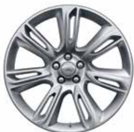
20" 7 SPLIT-SPOKE 'STYLE 7014'