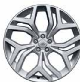
21" 5 SPLIT-SPOKE 'STYLE 5047'