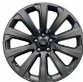
20" 10 SPOKE 'STYLE 1032' WITH SATIN DARK GREY FINISH