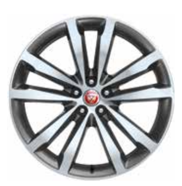
20" 5 SPLIT-SPOKE 'STYLE 5051' WITH SATIN GREY DIAMOND TURNED FINISH