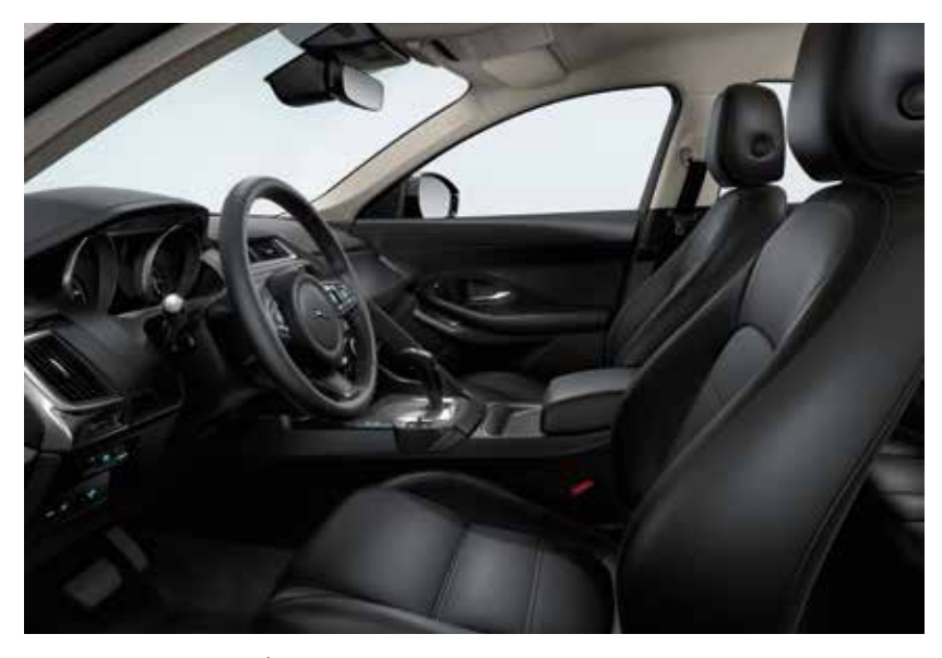
INTERIOR SHOWN: Ebony/Ebony interior with Ebony Stitch, Ebony Grained Leather Sport Seats with Light Oyster Headlining. 300HC Available on E-PACE S.