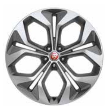
21" 5 SPLIT-SPOKE 'STYLE 5053' WITH SATIN GREY DIAMOND TURNED FINISH