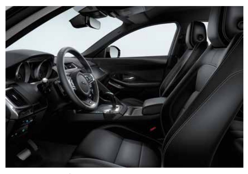
INTERIOR SHOWN: Ebony/Ebony interior with Light Oyster Stitch, Ebony Grained Leather Sport Seats with Ebony Headlining. 300HG Available on E-PACE R-Dynamic S / SE.