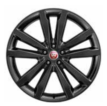
20" 5 SPLIT-SPOKE 'STYLE 5051' WITH GLOSS BLACK FINISH