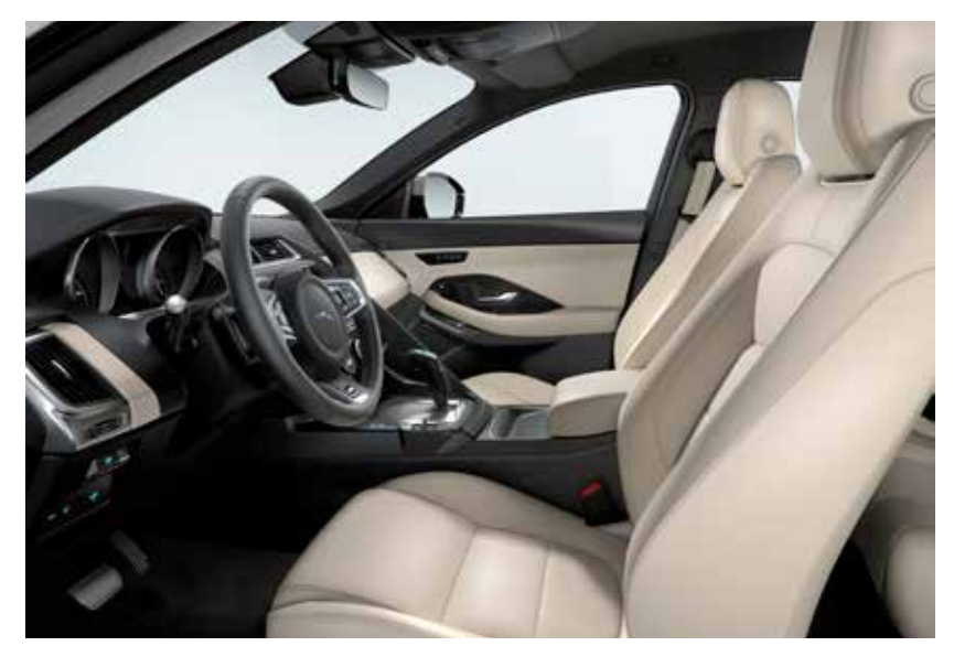
INTERIOR SHOWN: Ebony/Light Oyster interior with Light Oyster Stitch, Light Oyster Grained Leather Sport Seats with Ebony Headlining. 300HM Available on E-PACE R-Dynamic S / SE.