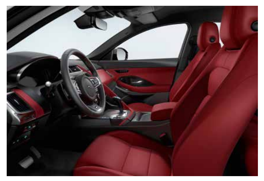
INTERIOR SHOWN: Ebony/Mars Red interior with Mars Red Stitch, Windsor Leather Sport Seats with Ebony Headlining. 300HN Available on E-PACE R-Dynamic S / SE.